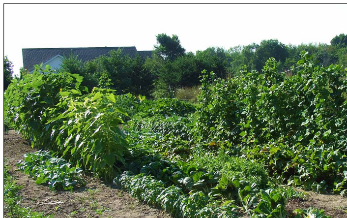
Rebecca Finneran, MSUE

To the new gardener, a word of caution: start small. Consider how much time and space you have available and do not start with a garden that may be more than you can manage. Depending on the amount of space and site conditions, you can consider a container vegetable garden, a small area with just a few plants, or a larger garden with a variety of vegetables.