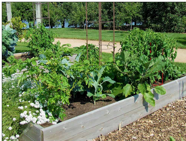
If drainage is an issue, raised beds can be very productive and easy to manage.

ground level and creating a raised garden. You can grow potatoes in a trash can, herbs in a bag of top soil or tomatoes in a hanging basket. Wherever you find a sunny location, there is the possibility of growing vegetables.