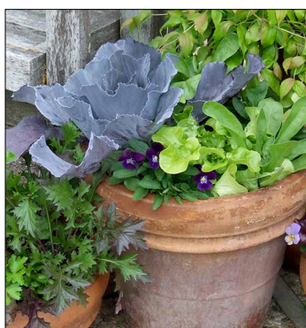
Rebecca Finneran, MSUE

Vegetables can be grown in a wide variety of containers, and they need not be fancy. Even a burlap bag will do.